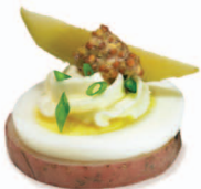
Potato Salad Bite Red Potato Slice, Hard Cooked Egg Slice, Mascarpone Cheese, Dijon Mustard, Sweet Pickle Wedge