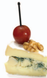
Torte Pick Camembert Cheese, Gorgonzola Cheese, Walnut, Red Grape