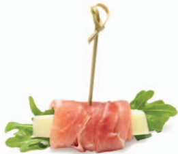
Ham & Cheese Pick Sharp White Cheddar Cheese, Arugula Leaves, Sliced Ham