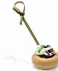
Mushroom Pick Pickled Mushroom, Ricotta Salata Cheese, Kalamata Olives, Capers, Parsley Garnish, Olive Oil Drizzle