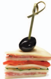
Rustica Pick Mild Provolone Cheese, Salami, Pepperoni, Basil, Roasted Red Pepper, Pitted Kalamata Garnish