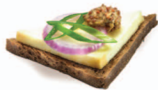
Monroe Bite Pumpnickel Cocktail Bread, Limburger Cheese, Red Onion, Green Onion, Whole Grain Mustard