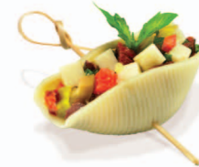
Shell Pick Fontina Cheese, Kalamata Olives, Roasted Red Peppers, Peperoncini, Capers, Basil Leaf Garnish