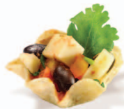
TexMex Bite Corn Chip Cup, Salsa Jack Cheese Cube, Black Bean Salsa, Cilantro Garnish