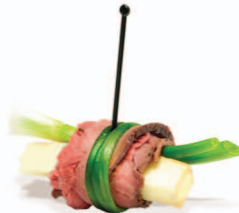
Muenster Beef Pick Muenster Cheese, Sliced Roast Beef, Green Onion