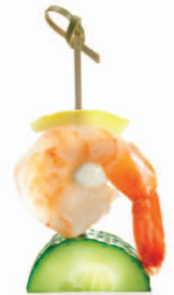
Shrimp Pick Thick Cucumber Slice, Cooked Shrimp, Fresh Mozzarella Cheese Pearl, Lemon Rind