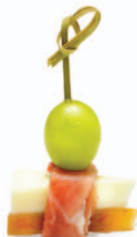
Tapas Pick Quince Paste, Queso Blanco Cheese, Serrano Ham, Green Grape