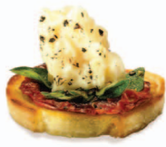
Roman Bite Bread Coin, Oil Cured Tomato, Oregano, Romano Cheese Chunk, Cracked Black Pepper, Olive Oil Drizzle