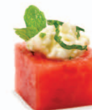
Watermelon Bite Watermelon, Feta Cheese, Mint Garnish