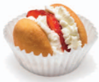
Strawberry Shortcake Bite Sugar Cookie or Short Bread, Mascarpone Cheese, Sliced Strawberry