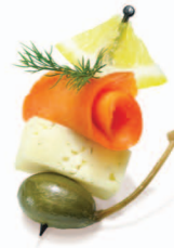
Smorg-More Pick Caper Berry, Dill Havarti Cheese, Lox/Cured Salmon, Baby Dill, Lemon Wedge Garnish